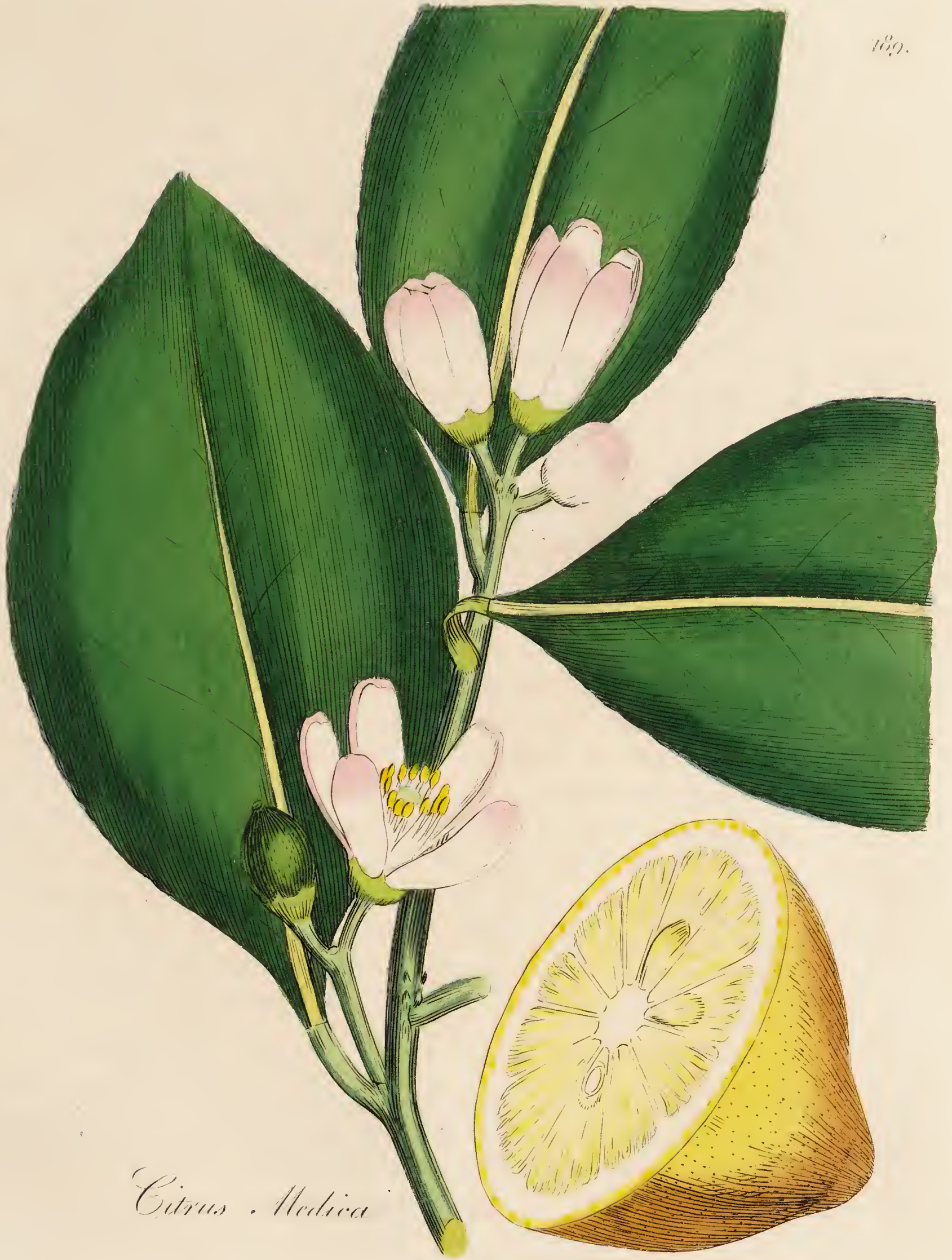
Citrus . Medica