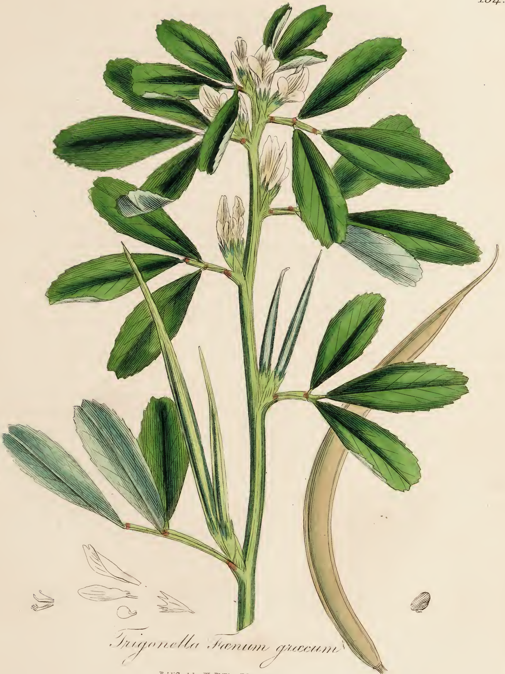
Trigonella Foeniculum griseum