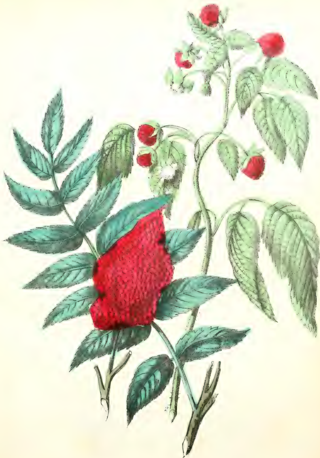
Hyland : Sumach, 2. Red Raspberry.