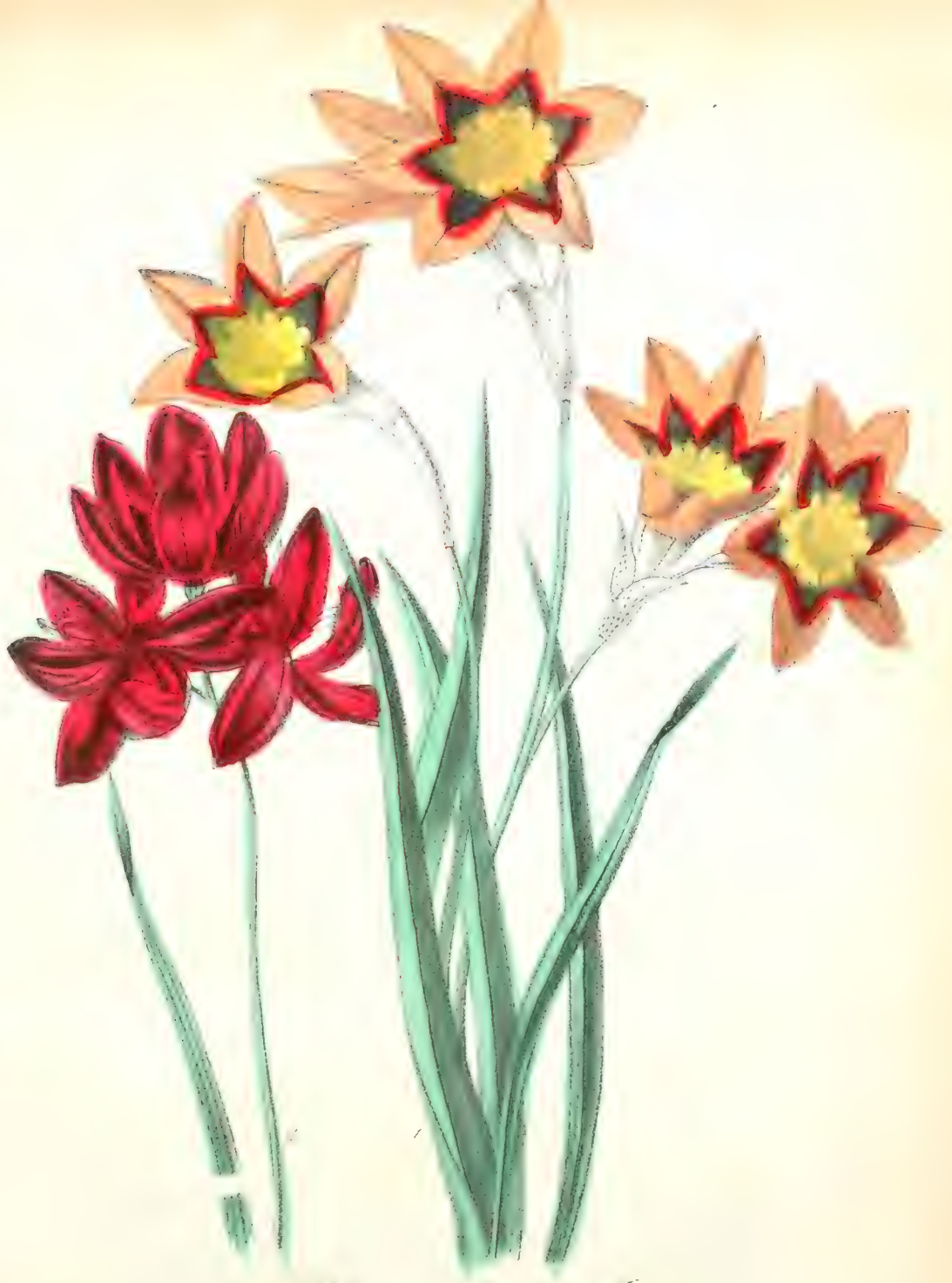
1. Three colored Iris. 2. Cape shaped Iris.