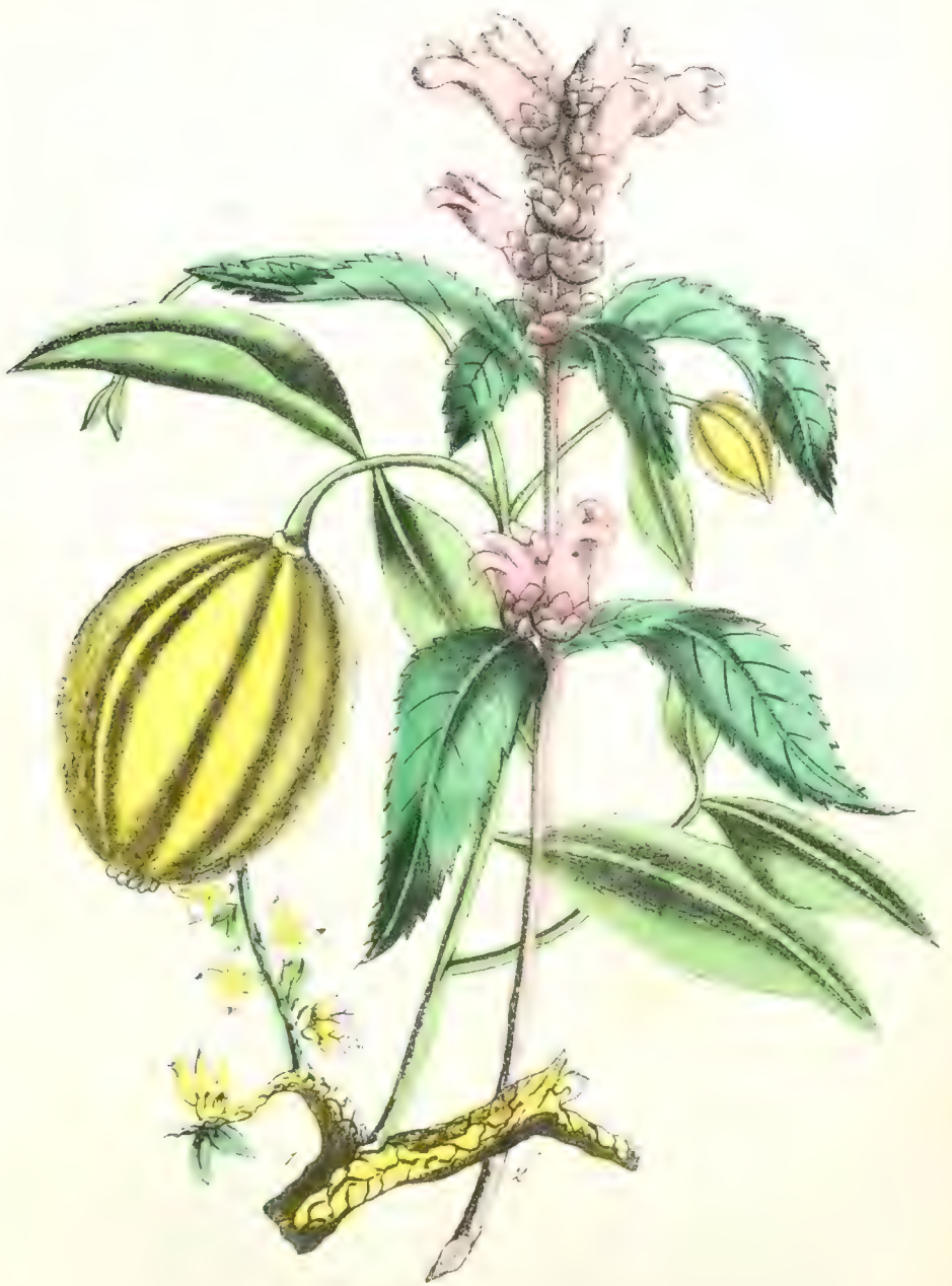
Gamboge Tree. Balmory.