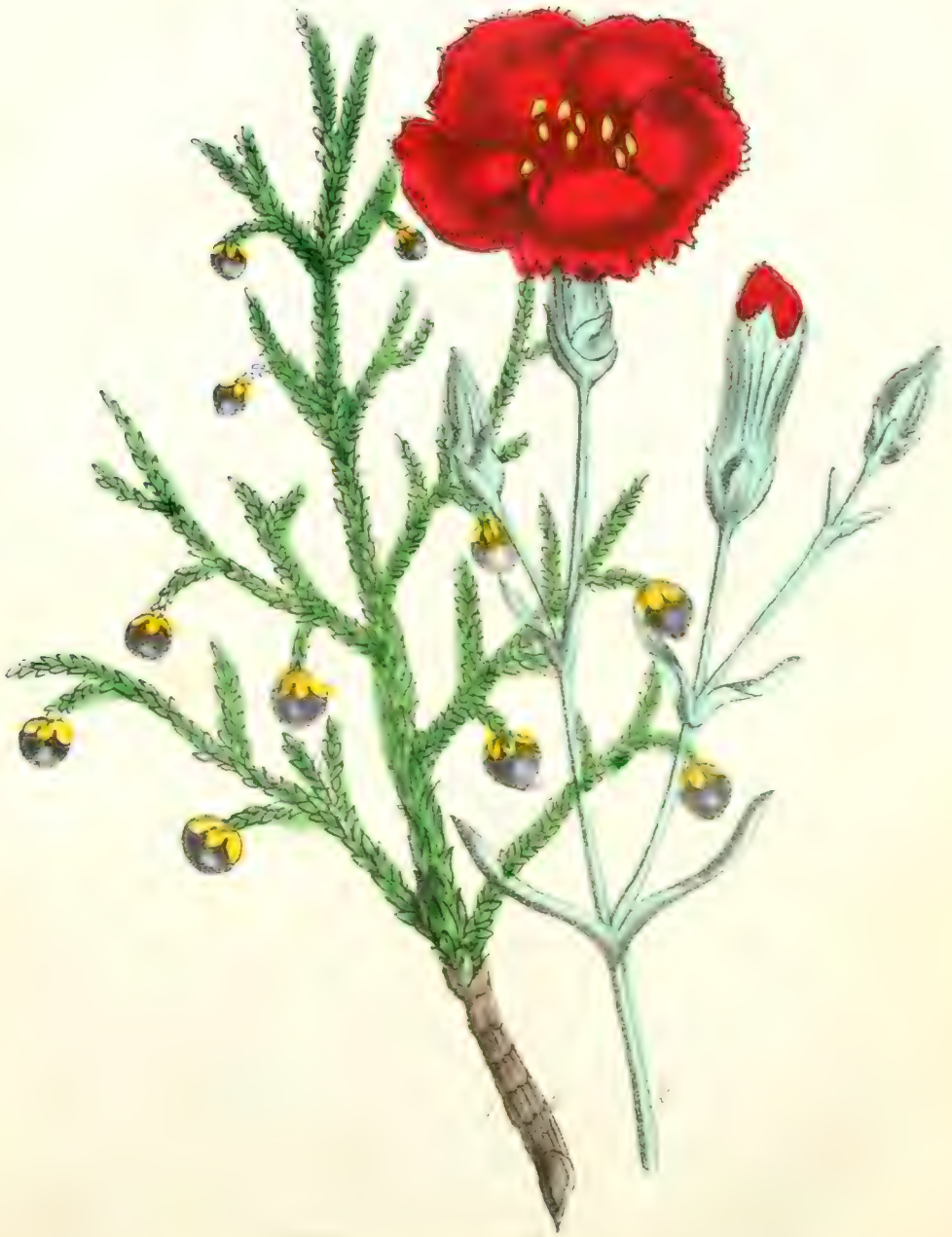
1. Common Lavine. 2. Clove & Carnation Pink