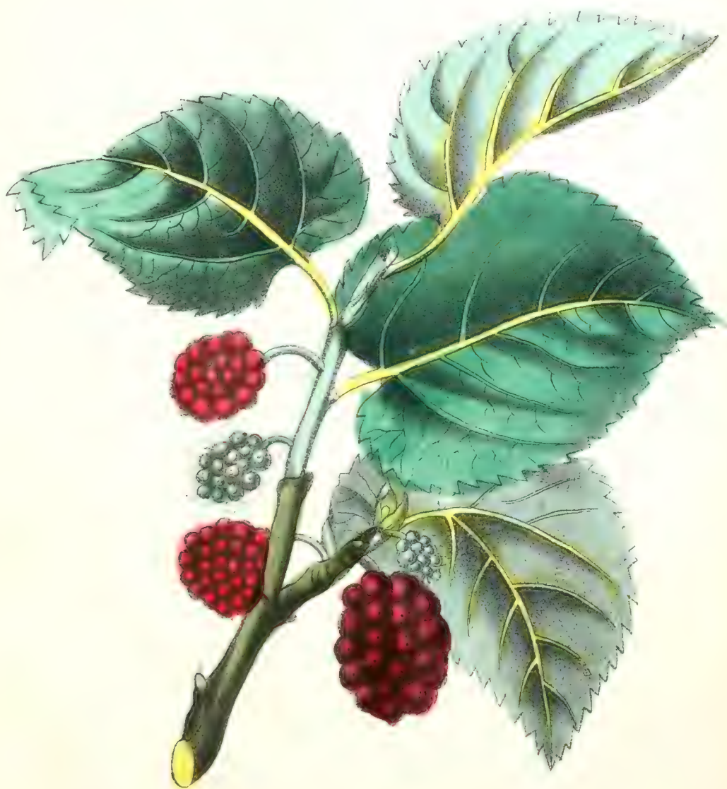
Common Mulberry Tree.