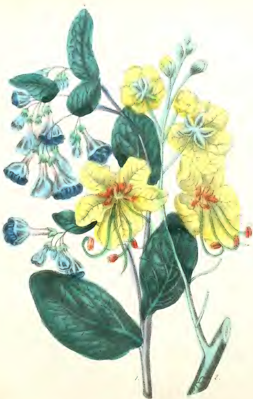
Common Lungwort. 2. Purging Cassia.