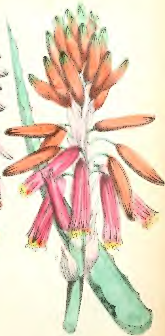
2. Socotrin Aloe.