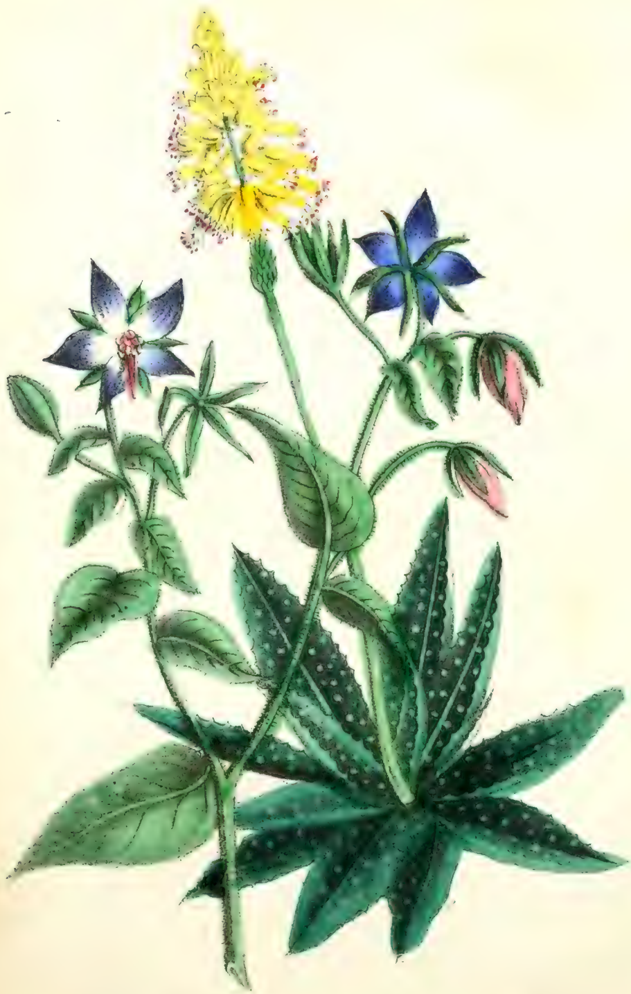
1. Common Berage. 2. Common Aloe.