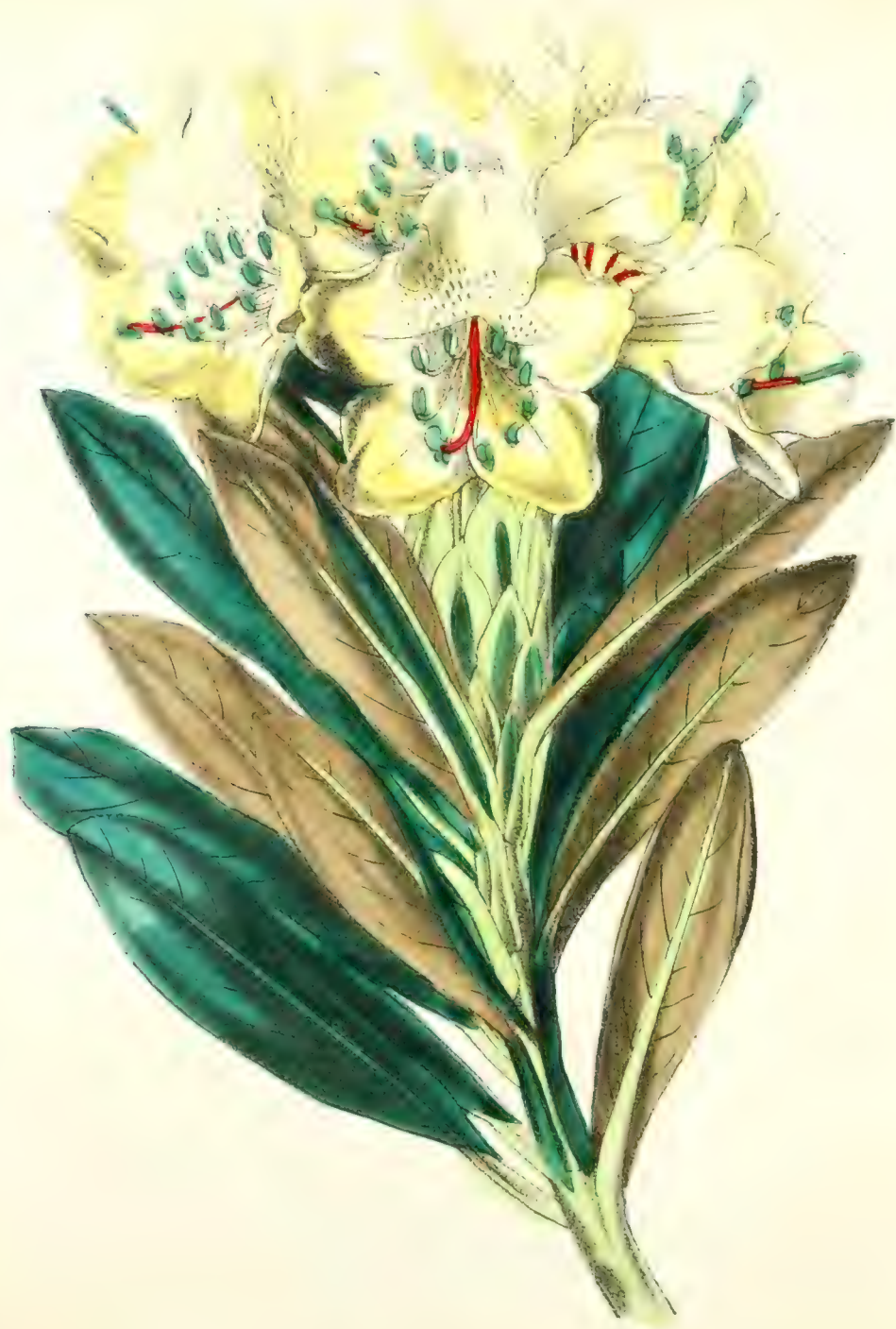
Yellow Flowering Rhododendron.