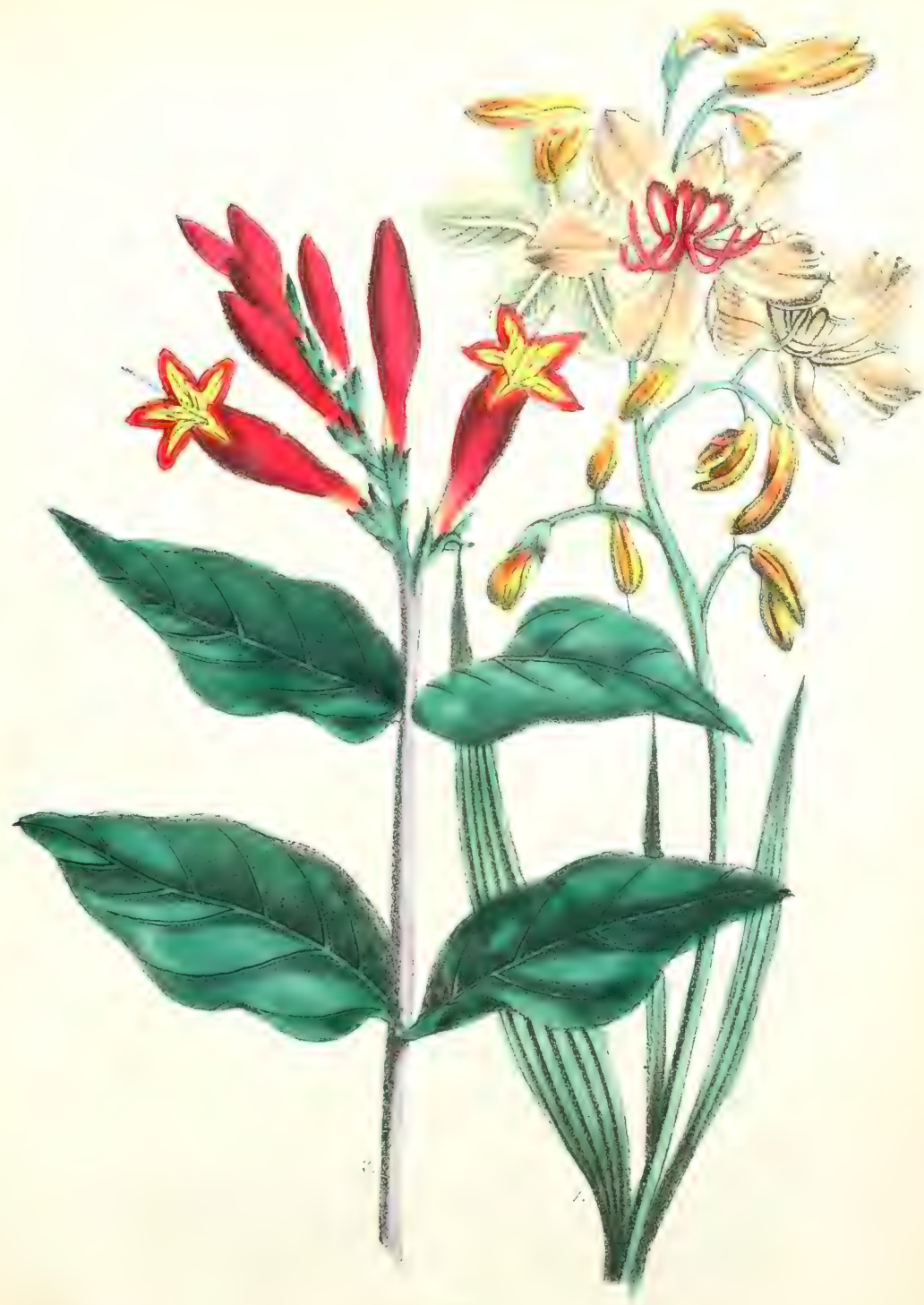
1. Wachendorfia . 2. Coccoloba 'Pink'.