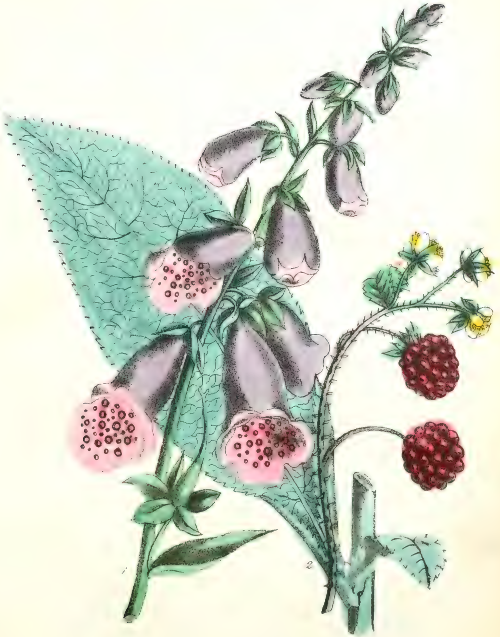
1, Fox-glove, 2, Common Raspberry.