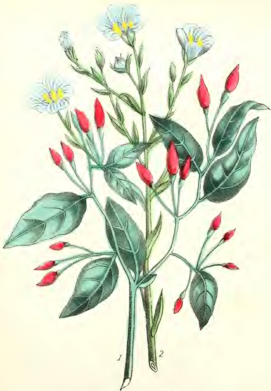
1 Guinea Pepper 2 Common Flax