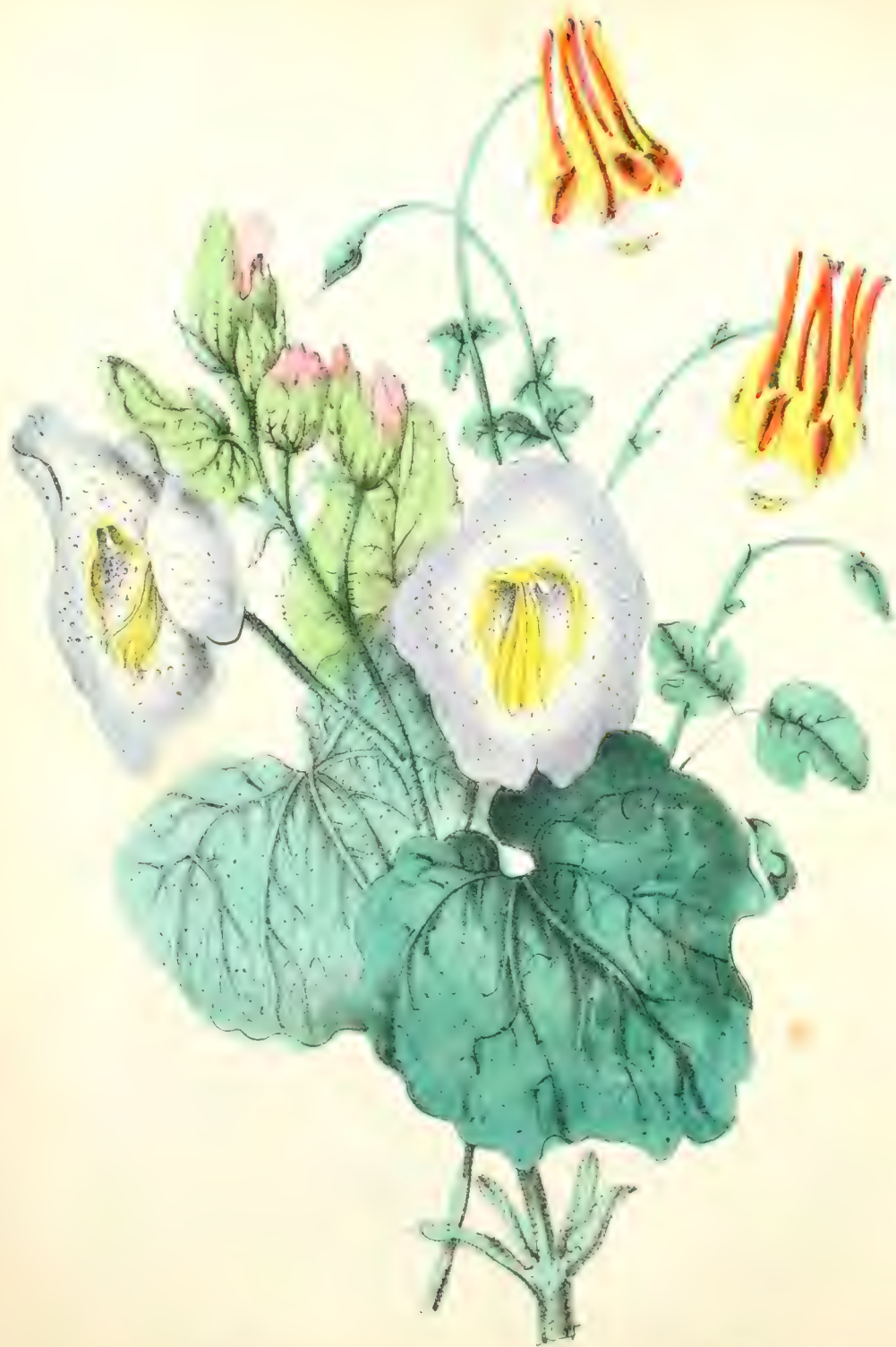
1 Mecon . Hartynia 2 Columbina