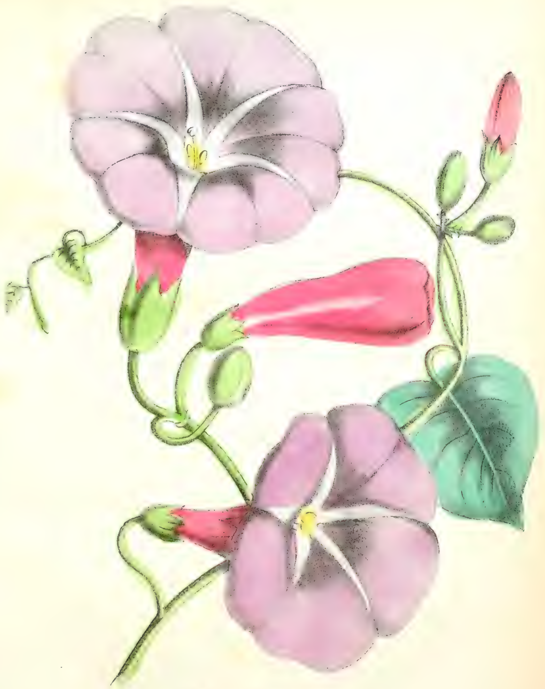
Julip Bind weed.