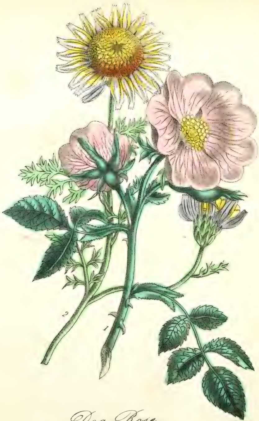
1 Dog Rose 2 Spanish Camomile