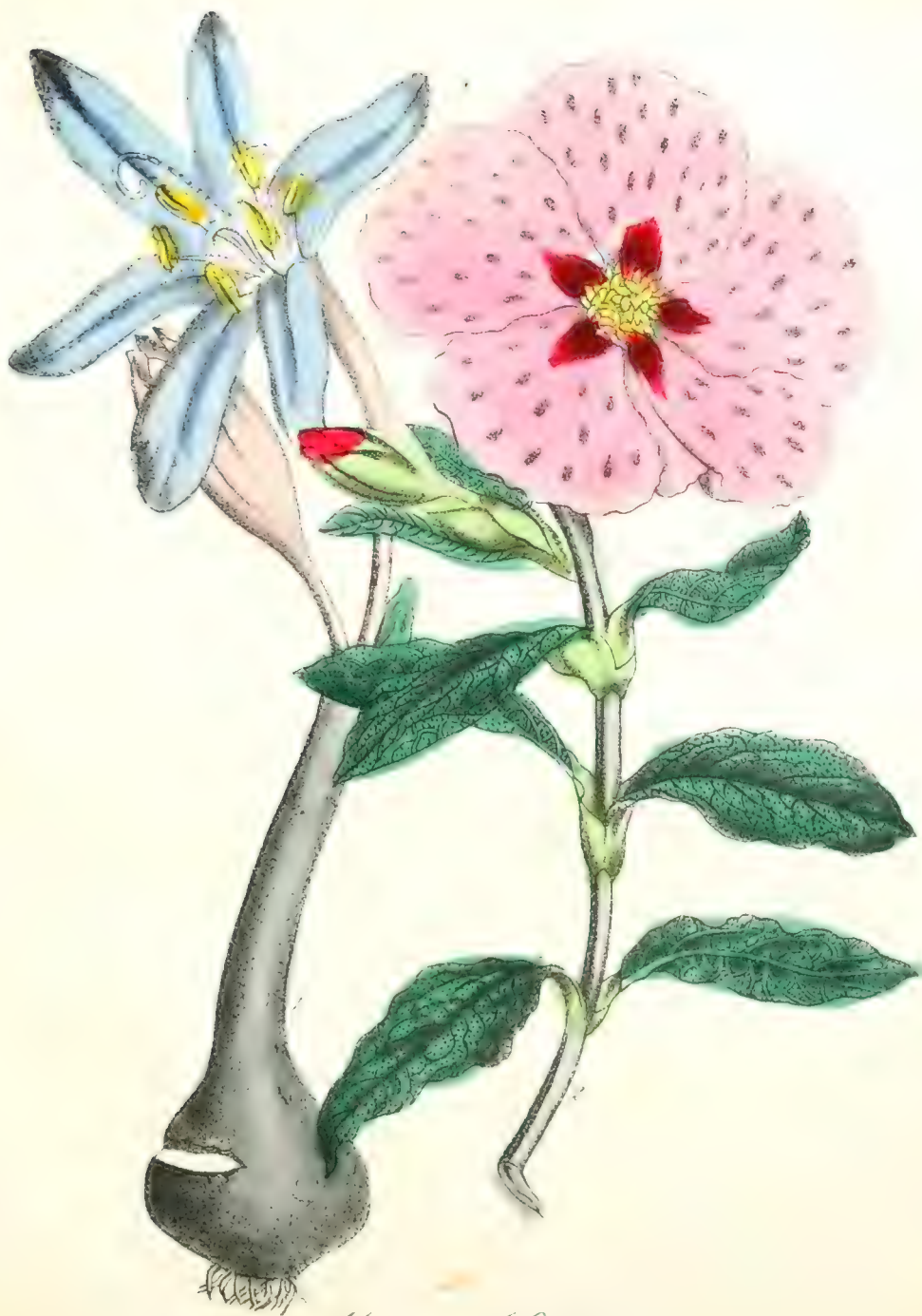
1. Meadow Saffron. 2. Crocus.