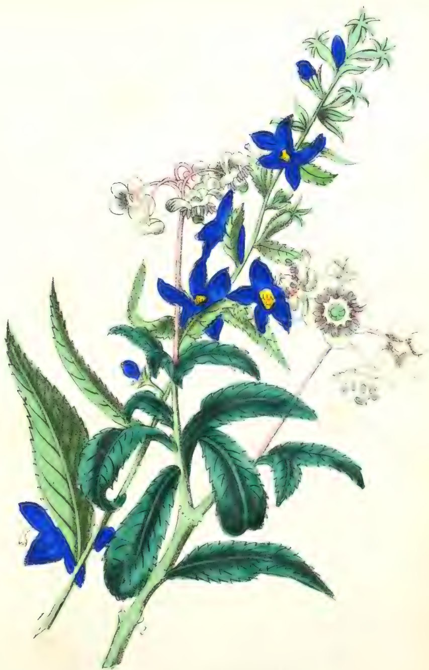
1. Blue Lobelia. 2. Pipsissewa.