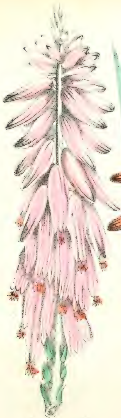
1. African Aloe.