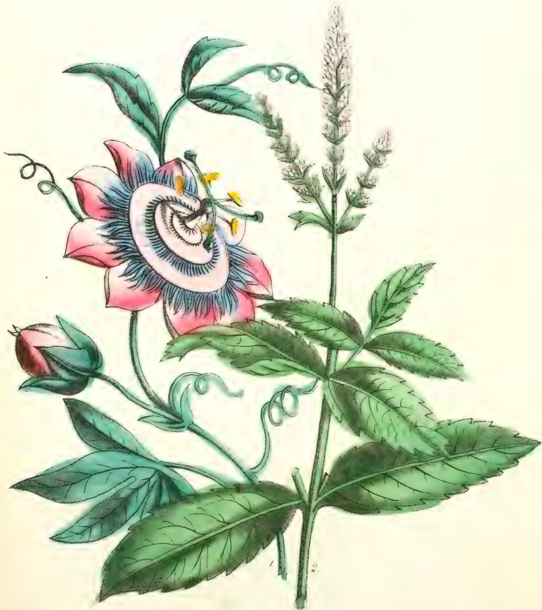
1, Passion Flower. 2, Spear-mint.