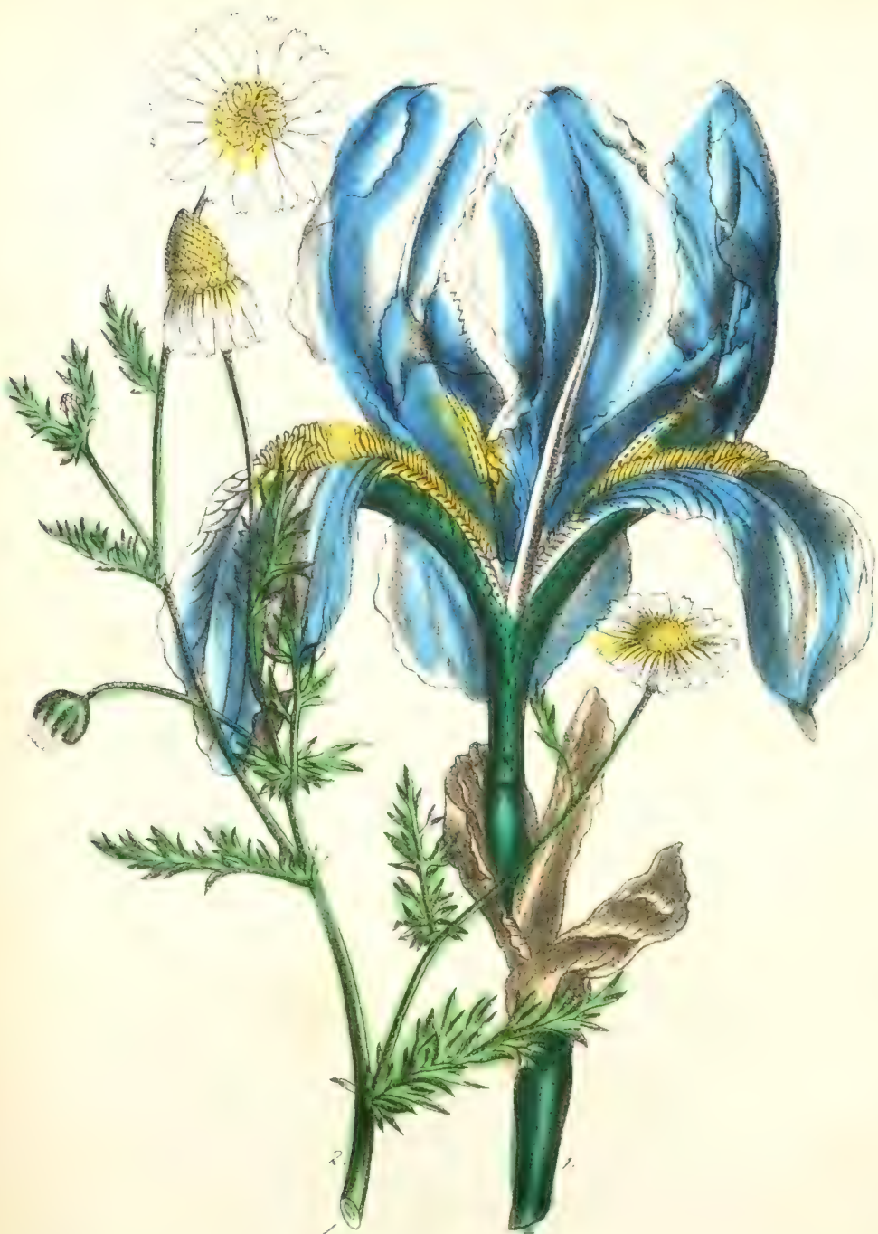
1. Florentine Iris. 2. Common Camomile.