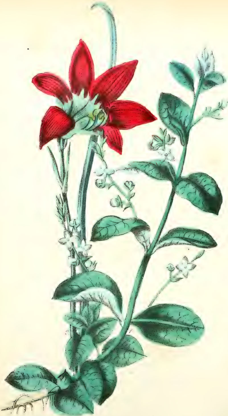
111. 112. 113. Rosy Flabranthus.