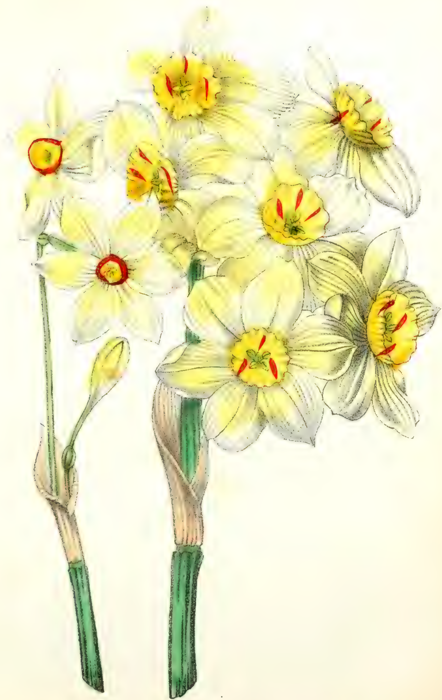
Three-anthered rush daffodil.