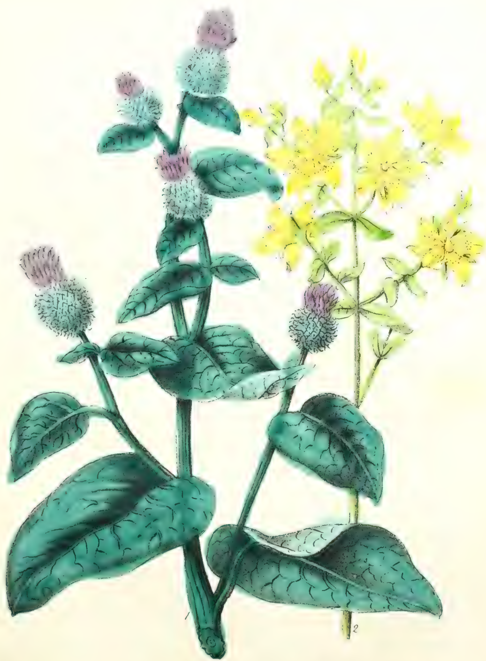
1. Burdock. 2. St. John's Wort.