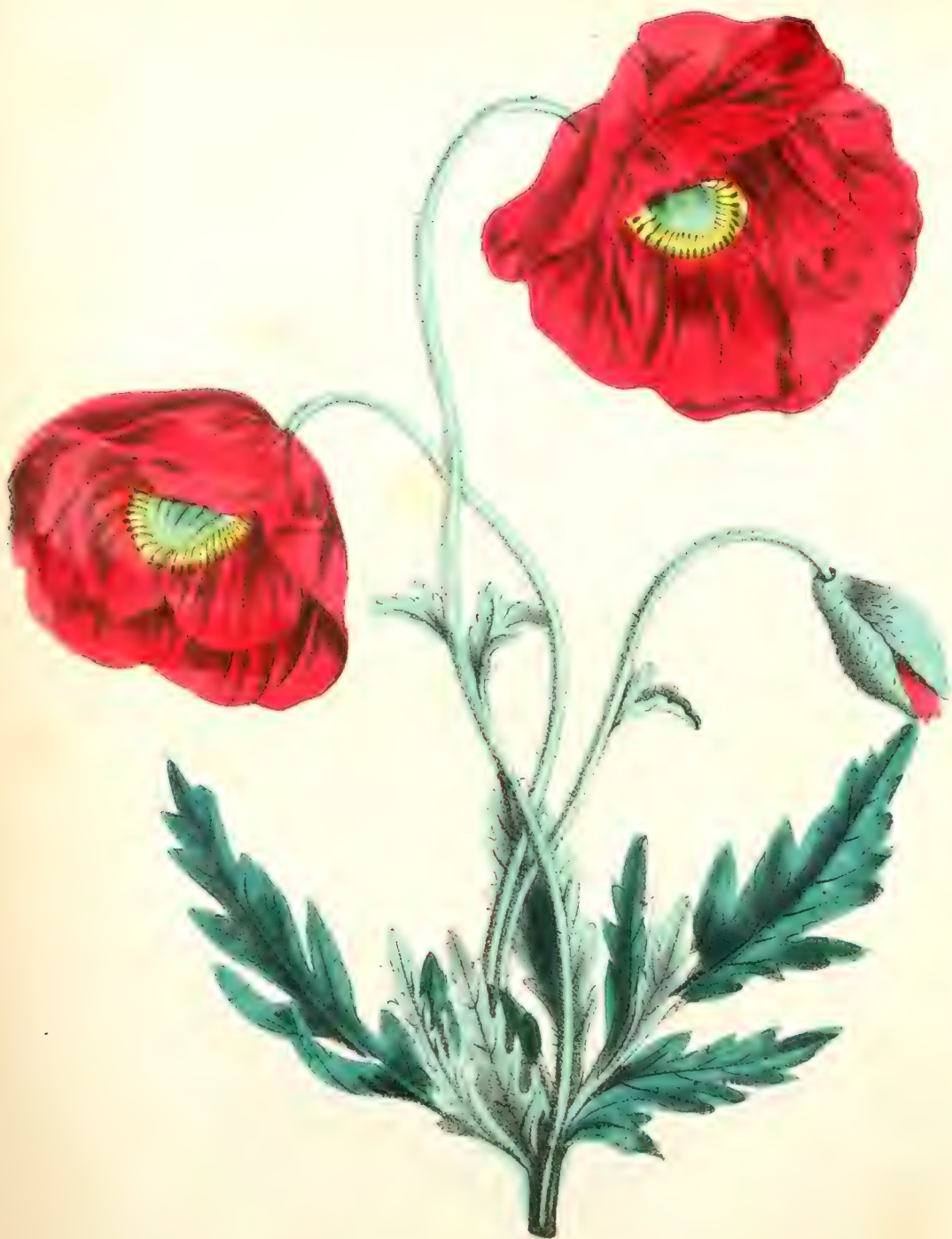
Red or Corn Poppy.