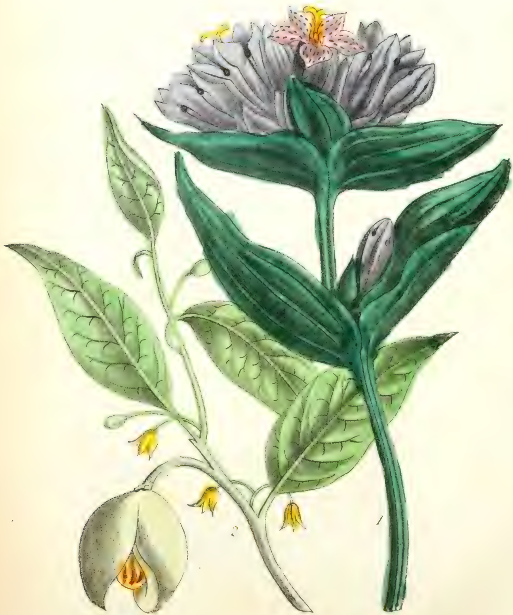
1 Purple Gentian. 2 Nutmeg Tree.