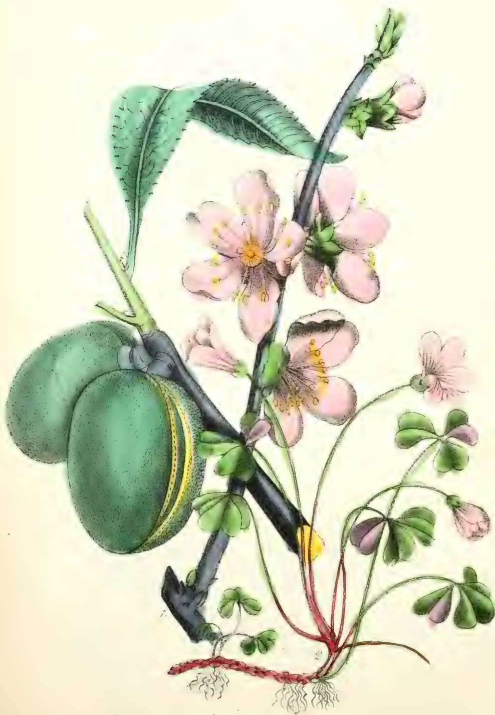
1. Common Almond Tree. 2. Wood Sorrel.