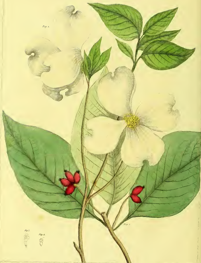
CORNUS FLORIDA. (Dogwood)