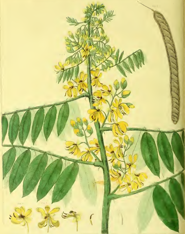
Fig. 1. Flower.