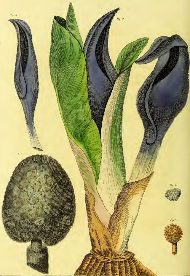
STYLOCARPUS var. ANGUSTIPATHA .