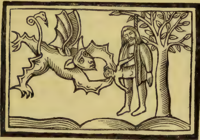
The Tree of Judas. From Maundeville's Travels .

In connection with the Crucifixion of our Lord many trees have had the ill-luck of bearing the name of the traitor Judas—the disciple who, after he had sold his Master, in sheer remorse and despair went and hanged himself on a tree.