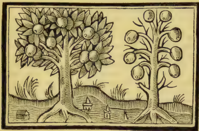
Dead Sea Fruit. From Maundevile's Travels.

cuttethe hem in two, he schalle fynd with in hem Coles and Cyndres, in tokene that, be wratthe of God, the cytees and the lond weren brente and sonken in to Helle."