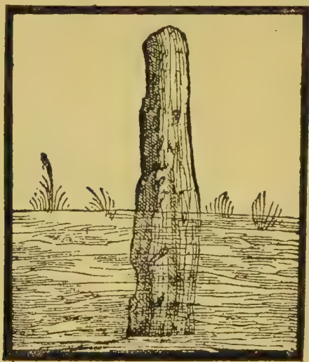
The Stone Tree. From Gerard's Herbal.

Gerarde tells us that among the wonders of England, worthy of great admiration, is a kind of wood, called Stony Wood, alterable into the hardness of a stone by the action of water. This strange alteration of Nature, he adds, is to be seen in sundry parts of England and Wales; and then he relates how he himself "being at Rugby (about such time as our fantasticke people did with great concourse and multitudes repaire and run headlong unto the sacred wells of Newnam Regis, in the edge of Warwickshire, as unto the water of life, which could cure all diseases)," went from thence unto these wells, "where I found growing ouer the same a faire Ashe-tree, whose boughs did hang ouer the spring of water, whereof some that were seare and rotten, and some that of purpose were broken off, fell into the water and were all turned into stones. Of these boughes or parts of the tree I brought into London, which when I had broken in pieces, therein might be seene that the pith and all the rest was turned into stones, still remaining the same shape and fashion that they were of before they were in the water."