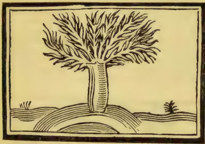
Arbor Secca, or The Withered Tree. From Maundeville's Travels.

called it Dirpe , and the people of the country, the Withered Tree, because from the date of the Passion of Our Lord, it has been withered, and will remain so until a Prince of the West shall come with the Christians to conquer the Holy Land: then "he shalle do synge a masse undir that dry tree, and than the tree shalle waxen grene and bere bothe fruyt and leves." Fra Mauro, in his map of the world, represents the Withered Tree in the middle of Central Asia. It has been surmised that this Withered Tree is no other than that alluded to by the Prophet Ezekiel (xvii., 24): "And all the trees of the field shall know that I the Lord have brought down the high tree, have exalted the low tree, have dried up the green tree."