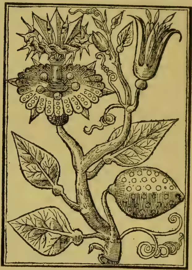
The Passion-flower of the Jesuits. From Parkinson's Paradisus .

his Paradisus Terrestris (1629), gives a good figure of the Virginian species of the plant, as well as an engraving of "The Jesuites Figure of the Maracoc— Granadillus Frutex Indicus Christi Passionis Imago ." But, as a good Protestant, he feels bound to enter his protest against the superstitious regard paid to the flower by the Roman Catholics, and so he writes: "Some superstitious Jesuites would fain make men believe that in the flower of this plant are to