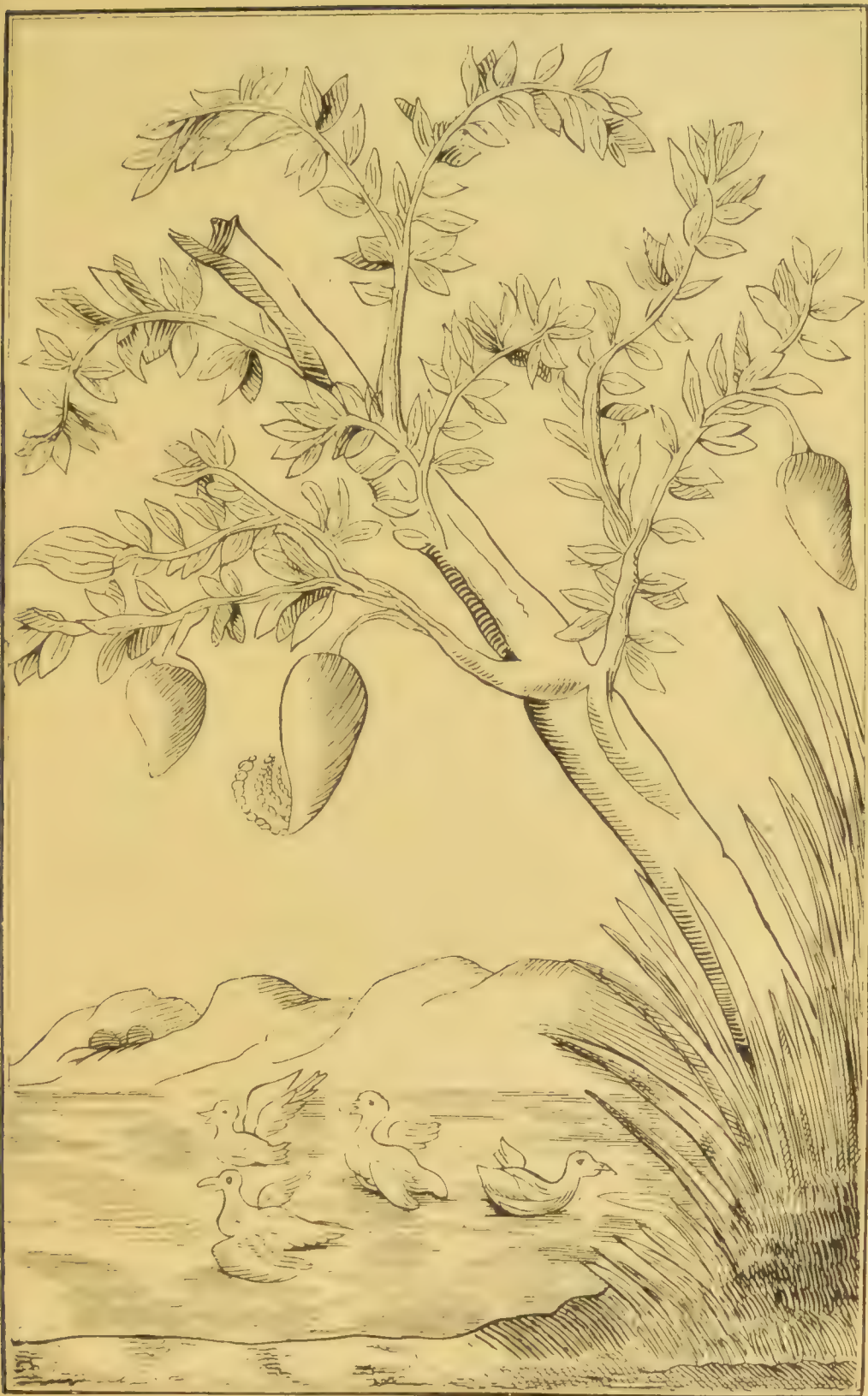
The Barnacle or Goose Tree.