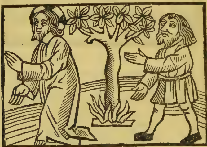
Miraculous Tree of Tiberias. From Maundevile's Travels.

Maundevile has preserved a record of a tree of miraculous origin, that in his time grew in the city of Tiberias. The old knight writes:—"In that cytee a man cast an brennyng [a burning] dart in wratthe after oure Lord, and the hed smote in to the eerthe, and wex grene, and it growed to a gret tree; and yit it growethe, and the bark there of is alle lyke coles."