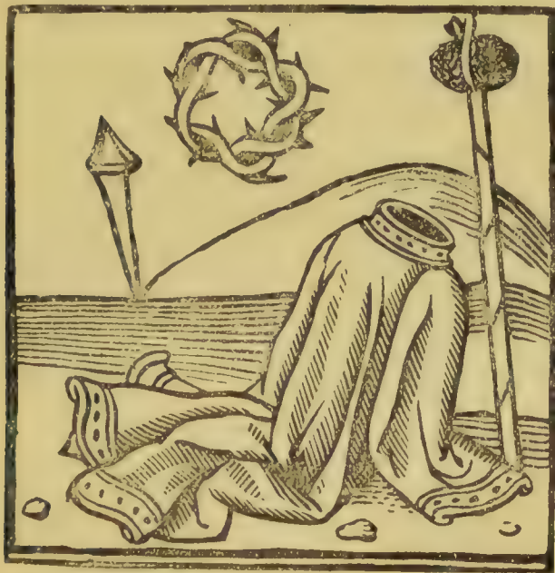
Relics of the Crucifixion. From Maundeville's Travels.

and there the Jewes scorned Him, and maden Him a croune of the braunches of Albespyne, that is White Thorn, that grew in the same gardyn, and setten it on His heved, so faste and so sore, that the blood ran doun be many places of His visage, and of His necke, and of His schuldres. And therefore hathe the White Thorn many vertues; for he that berethe a braunche on him thereoffe, no thondre, ne no maner of tempest may dere him; ne in the hows that it is inne may non evylle gost entre ne come unto the place that it is inne. And in that same gardyn Seynt Petre denied oure Lord thryes. Aftreward was oure Lord lad forth before the bischoppes and the maystres of the lawe, in to another gardyn of Anne; and there also He was examyned, repreved, and scorned, and crouned eft with a White Thorn, that men clepethe Barbarynes, that grew in that gardyn; and that hathe also many vertues. And afterward He was lad into a gardyn of Cayphas, and there He was crouned with Eglentier. And aftre He was lad in to the chambre of Pylate, and there He was examynd and crouned. And the Jewes setten Hym in a chayere and cladde Hym in a mantelle; and there made thei the croune of Jonkes of the see; and there thei kneled to Hym, and skorned Hym, seyenge: 'Heyl, King of the Jewes!'"