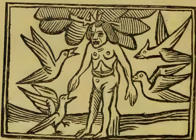
The Tree of Death. From Maundevile's Travels .

The ancients were wont to hang their criminals either to barren trees, or to those dedicated to the infernal gods ; and we find that in Maundevile's time the practice of hanging corpses on trees existed in the Indies, or, at any rate, on an island which he describes as being called Caffolos. He gives a sketch of a tree, probably a Palm, with a man suspended from it, and remarks that " Men of that Ctree, whan here Frenedes ben seke, thei hangen hem upon Trees ; and seyn, that it is bettre that briddes, that ben Angeles of God, eten hem, than the foul Wormes of the Erthe."