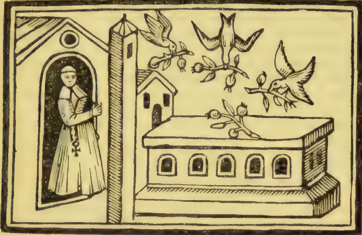
Pious Birds and Olives. From Maundeville's Travels.

Bayes or of Olive, in here bekes, in stede of Offryng, and leven hem there; of the whiche the monkes maken gret plentee of Oyle; and this is a gret Marvaylle."