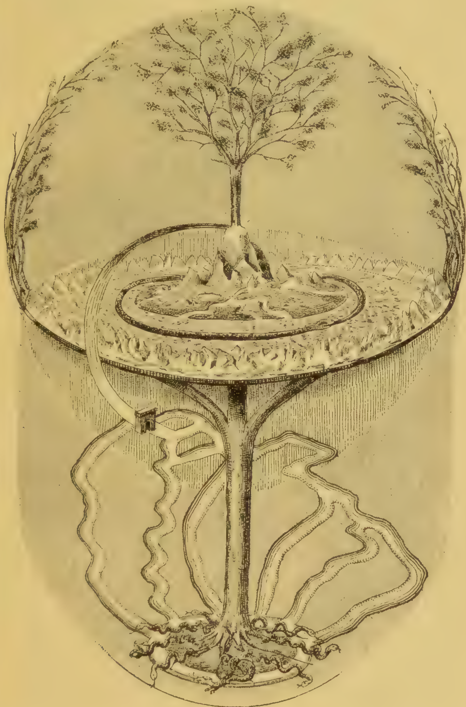
Yggdrasil, the Mundane Tree.