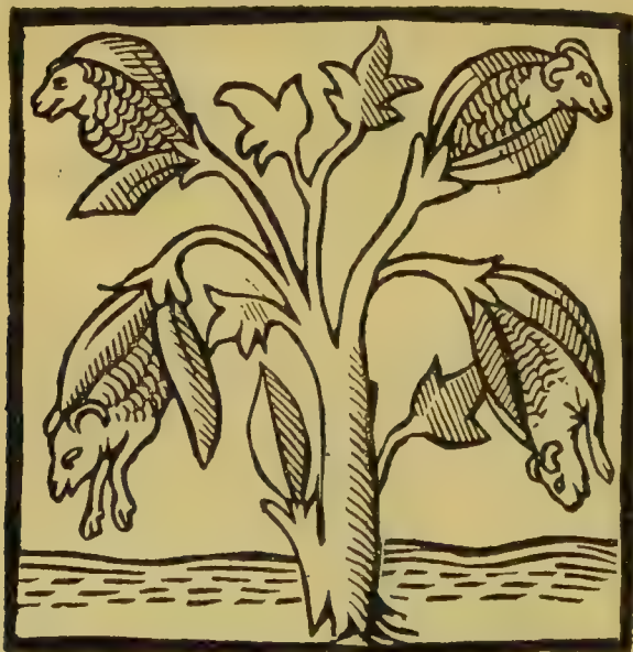
The Lamb Tree. From Maundevile's Travels.

Scaliger, in his Exoticae Exercitationes , gives a similar description, adding that it is not the fruit, the Melon, but the whole plant, that resembles a lamb. This does not tally with the account given by Odorico da Pordenone, an Indian traveller, who, before the Barometz had been heard of in Europe, appears to have been informed that a plant grew on some island in the Caspian Sea which bore Melon-like fruit resembling a lamb; and this tree is described and figured by Sir John Maundevile, who, in speaking of the countries and isles beyond Cathay, says that when travelling towards Bacharye "men passen be a Kyngdom that men clepen Caldilhe; that is a fulle fair Contree. And there growethe a maner of fruyt as though it waren Gowrdes; and whan thei ben ripe, men kutten hem a to, and men fynden with inne, a lytylle Best, in flessche, in bon, and blode, as though it were a lytylle Lomb, with outen wolle. And men eten bothe the Frut and the Best; and that is a gret marveylle. Of that Frute I have eten; alle thoughe it were wonderfule; but that I knowe wel that God is marveyllous in his werkes."