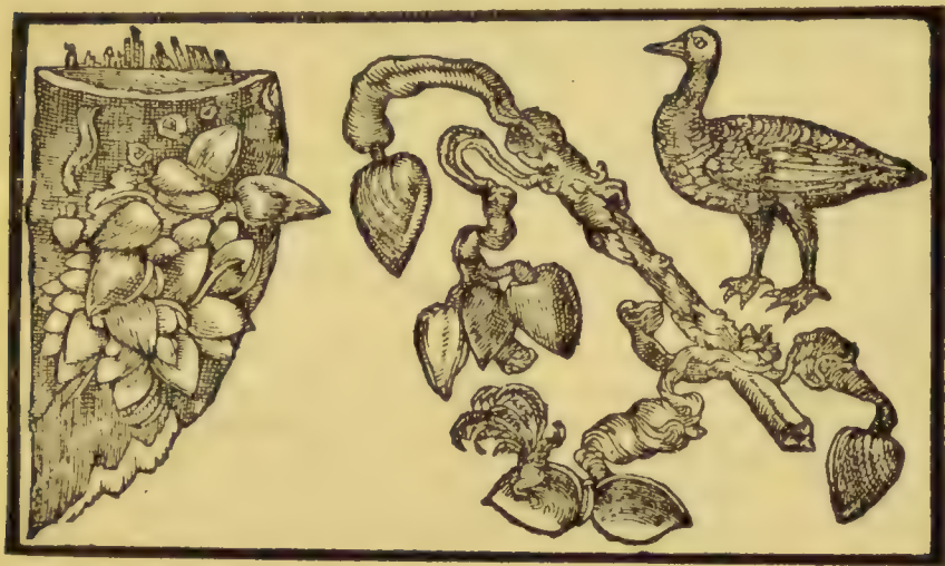
The Goose Tree. From Gerard's Herbal.

have seen," he says, "and what our hands have touched, we shall declare. There is a small island in Lancashire, called the Pile of Foulders, wherein are found broken pieces of old ships, some whereof have been thrown thither by shipwracke, and also the trunks and bodies, with the branches of old and rotten trees cast up there likewise; whereon is found a certain spume or froth, that in time breedeth unto certaine shells, in shape like to those of the muskle, but sharper pointed, and of a whitish colour, wherein is contained a thing in forme like a lace of silke finely woven, as it were, together, of a whitish colour; one end whereof is fastned unto the inside of the shell, even as the fish of oisters and muskles are; the other end is made fast unto the belly of a rude mass, or lumpe, which, in time, commeth to the shape and forme of a bird. When it is perfectly formed, the shell